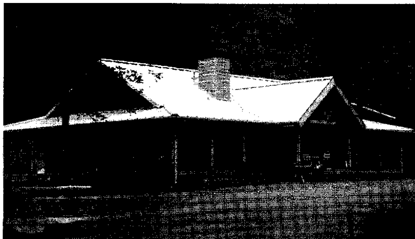
Above, the Lodge offers all the amenities you could want, and then some. Below, you can’t beat camping in the trees, on soft grass alongside a stream.

Charlene serves simple, but plentiful and very tasty meals from the pavilion’s kitchen